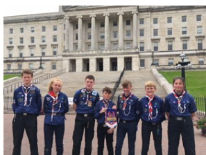
Scouts at Stormont