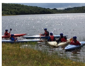
Water Activities & Beavers